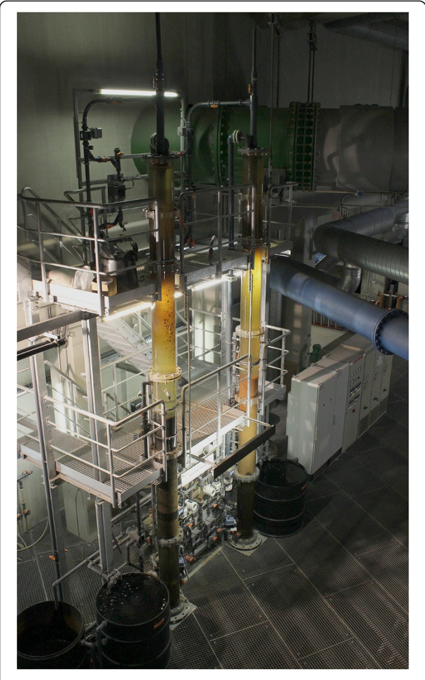
Figure 3 Dual-media rapid filters of the pilot plant in the PEP Tegel in Berlin.

Results show that the filter performance of the GAC filter was equal to the reference representing the setup of the large-scale plant. Phosphorus removal was almost equal to the reference filter resulting in mean concentrations of 16 and 17 \mu g/L. Likewise, parameters such as dissolved organic carbon (DOC), total suspended solids, UV light absorption at 254 nm wavelength, turbidity and colour values showed no significant difference between the two filters.